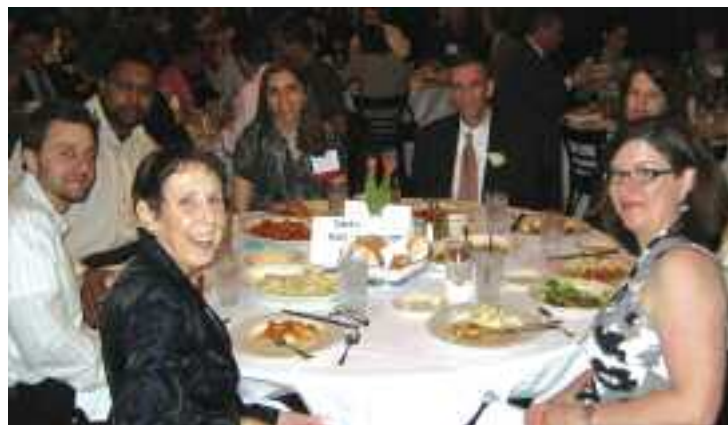
LPCC members celebrated the neighborhood and dined on classic Italian dishes at Salvatore's Ristorante during the Annual Awards Ceremony held on May 12, 2011.